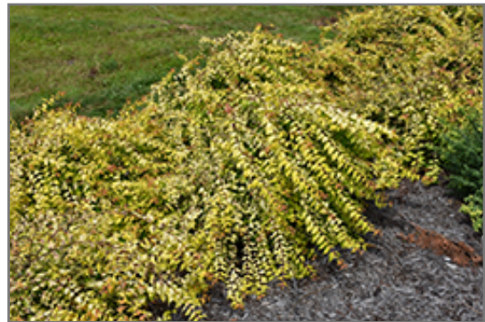
Dream Catcher Beautybush