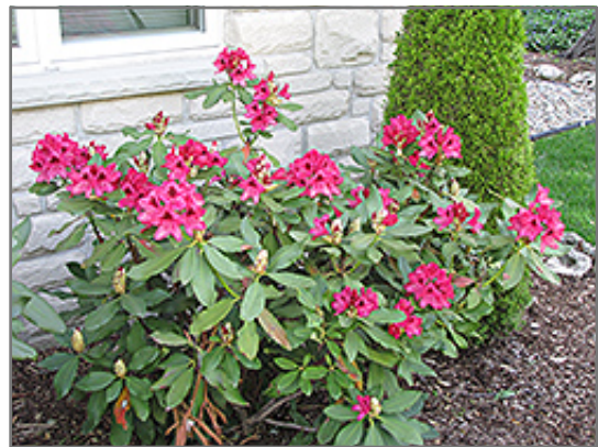
Nova Zembla Rhododendron in bloom