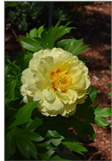
Bartzella Peony flowers