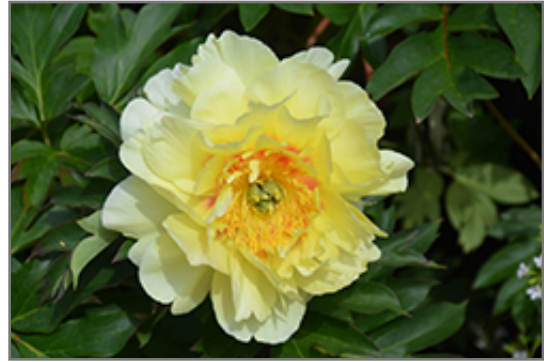
Bartzella Peony flowers

Bartzella Peony is recommended for the following landscape applications;