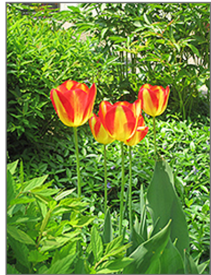
Antoinette Tulip in bloom