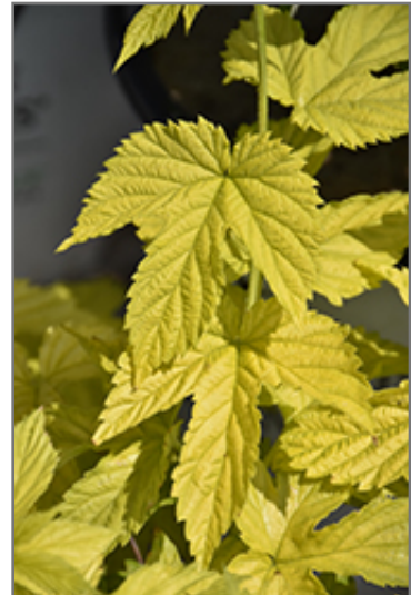
Golden Hops foliage