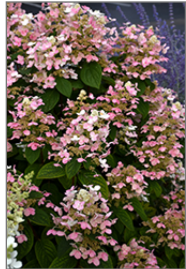
Quick Fire Hydrangea flowers