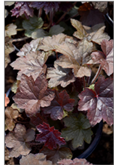
Palace Purple Coral Bells foliage

Palace Purple Coral Bells is recommended for the following landscape applications;