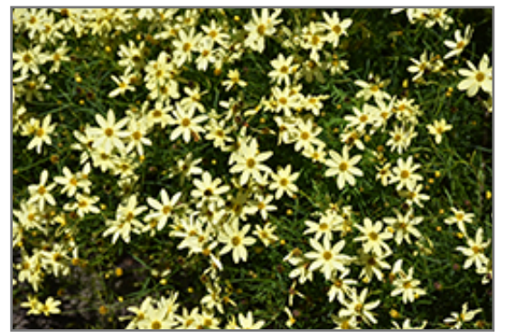
Moonbeam Tickseed flowers