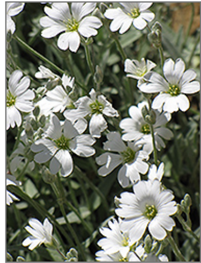
Snow-In-Summer flowers