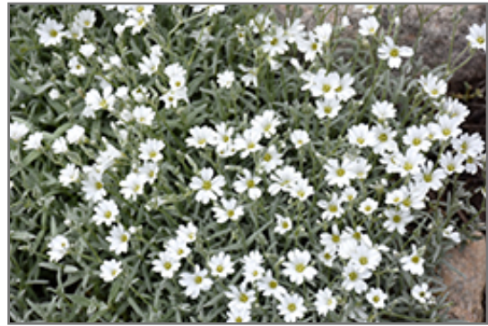
Snow-In-Summer flowers