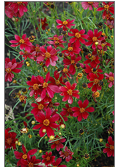
Red Satin Tickseed flowers