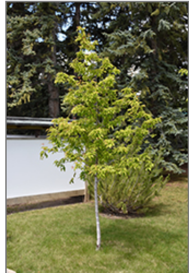
Amur Maple (tree form)