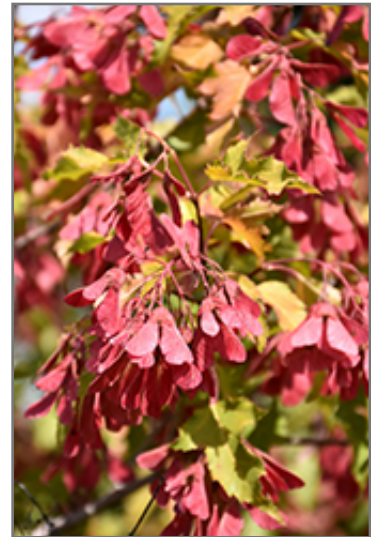
Amur Maple (tree form) fruit

* This is a 'special order' plant - contact store for details