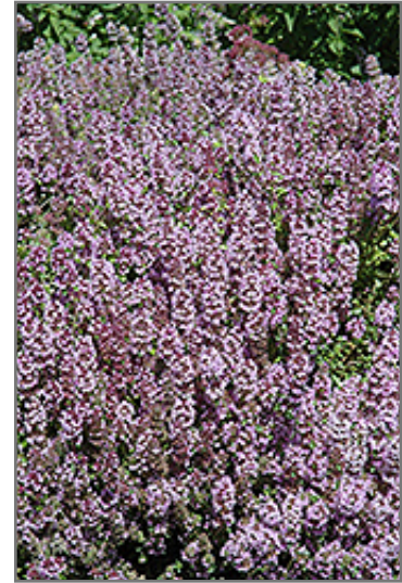
Mother-of-Thyme in bloom