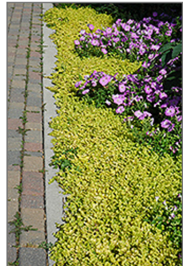
Golden Creeping Jenny