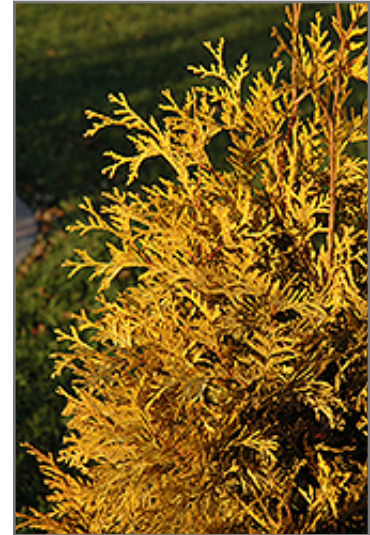
Yellow Ribbon Arborvitae in fall

This shrub does best in full sun to partial shade. It prefers to grow in average to moist conditions, and shouldn't be allowed to dry out. It is not particular as to soil type or pH. It is somewhat tolerant of urban pollution, and will benefit from being planted in a relatively sheltered location. Consider applying a thick mulch around the root zone in winter to protect it in exposed locations or colder microclimates. This is a selection of a native North American species.