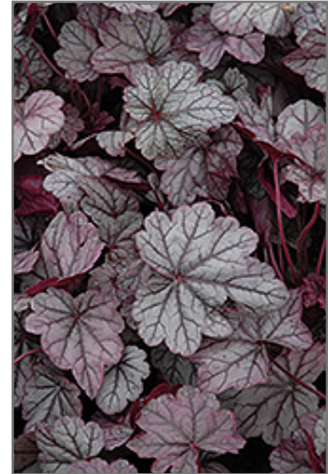
Carnival Sugar Plum Coral Bells foliage

This is a relatively low maintenance plant, and should be cut back in late fall in preparation for winter. It is a good choice for attracting hummingbirds to your yard. It has no significant negative characteristics.