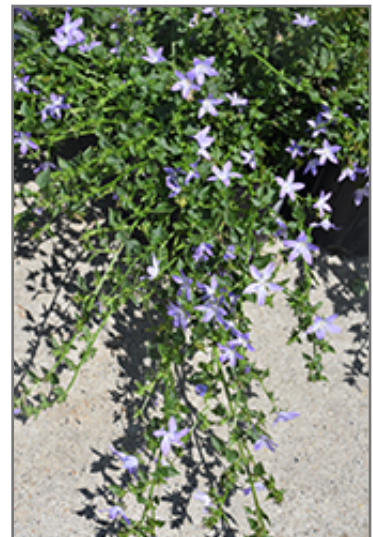
Blue Waterfall Serbian Bellflower in bloom