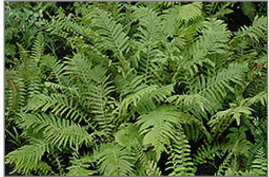
Christmas Fern