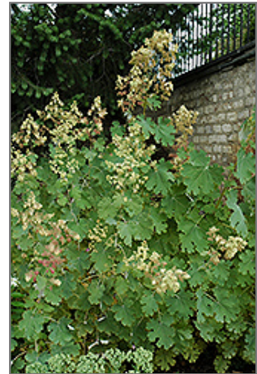
Plume Poppy in bloom