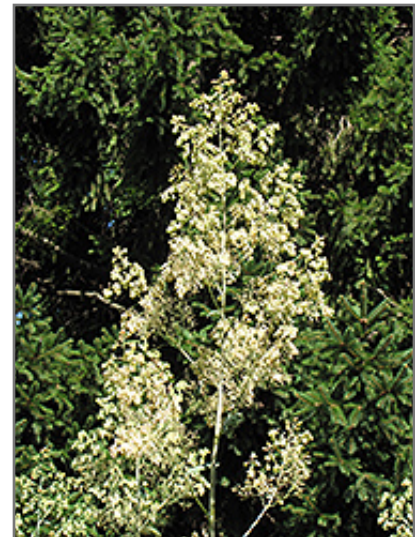
Plume Poppy flowers