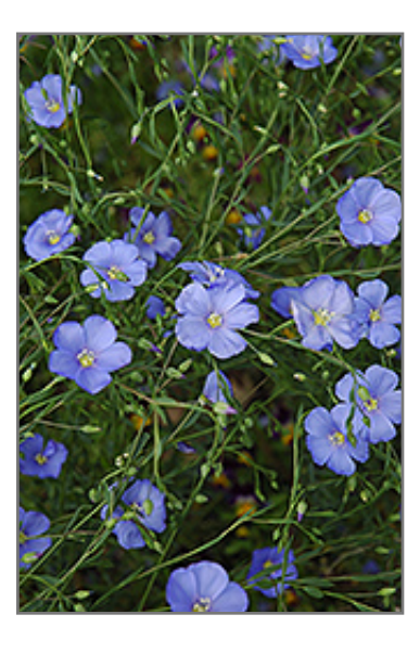
Perennial Flax flowers

Perennial Flax will grow to be about 24 inches tall at maturity, with a spread of 12 inches. When grown in masses or used as a bedding plant, individual plants should be spaced approximately 8 inches apart. It tends to be leggy, with a typical clearance of 1 foot from the ground, and should be underplanted with lower-growing perennials. It grows at a fast rate, and under ideal conditions can be expected to live for approximately 3 years. As an herbaceous perennial, this plant will usually die back to the crown each winter, and will regrow from the base each spring. Be careful not to disturb the crown in late winter when it may not be readily seen!