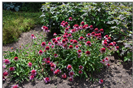
Double Scoop Bubble Gum Coneflower in bloom