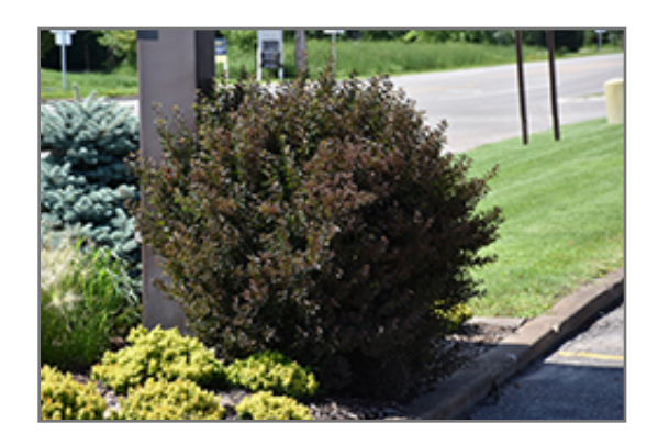
Little Devil Ninebark

Little Devil Ninebark is recommended for the following landscape applications;