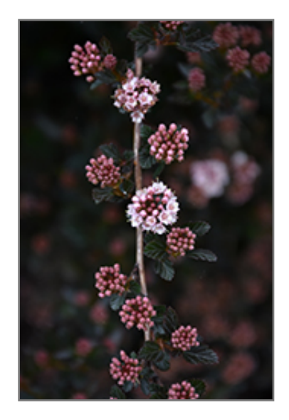
Little Devil Ninebark flowers