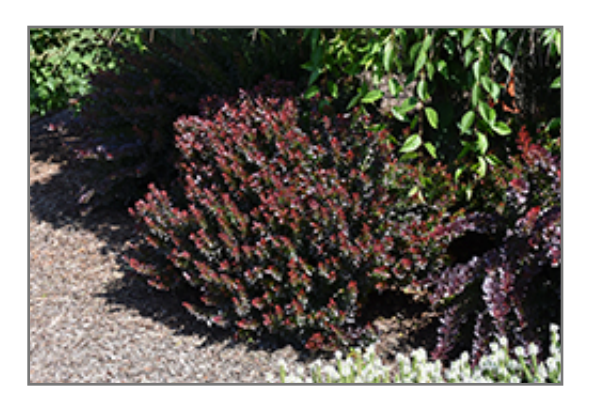
Midnight Ruby Barberry