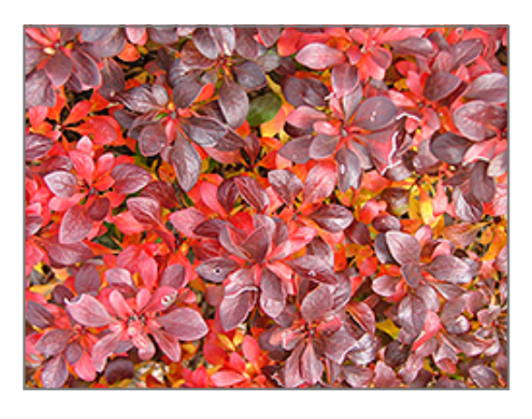
Midnight Ruby Barberry in fall