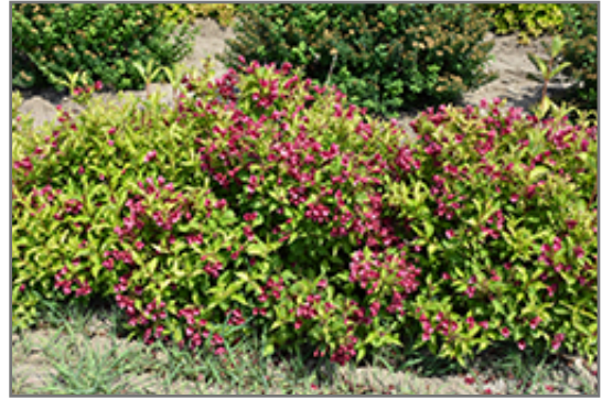
Ghost Weigela in bloom

This shrub should only be grown in full sunlight. It prefers to grow in average to moist conditions, and shouldn't be allowed to dry out. It is not particular as to soil type or pH. It is highly tolerant of urban pollution and will even thrive in inner city environments. This is a selected variety of a species not originally from North America.