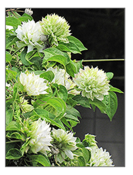
Duchess of Edinburgh Clematis flowers