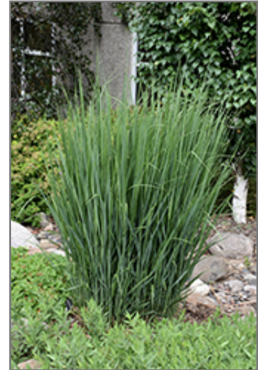
Northwind Switch Grass