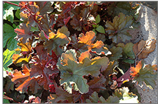
Chocolate Ruffles Coral Bells foliage

Chocolate Ruffles Coral Bells will grow to be about 10 inches tall at maturity extending to 24 inches tall with the flowers, with a spread of 12 inches. When grown in masses or used as a bedding plant, individual plants should be spaced approximately 10 inches apart. Its foliage tends to remain low and dense right to the ground. It grows at a medium rate, and under ideal conditions can be expected to live for approximately 10 years. As an evergreen perennial, this plant will typically keep its form and foliage year-round.