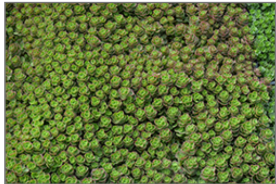
Dragon's Blood Stonecrop foliage