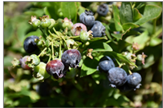
Jelly Bean Blueberry fruit