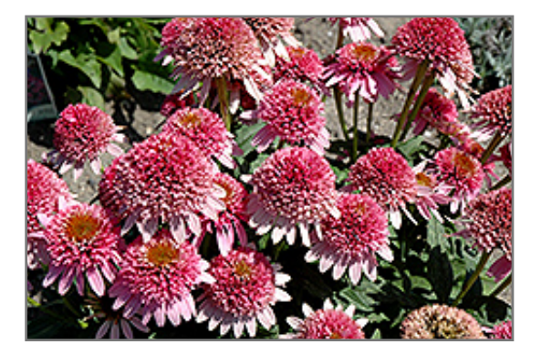
Butterfly Kisses Coneflower flowers