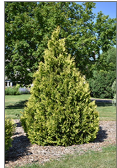
Yellow Ribbon Arborvitae