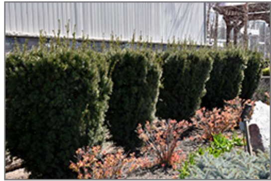
Hicks Yew

This shrub performs well in both full sun and full shade. However, you may want to keep it away from hot, dry locations that receive direct afternoon sun or which get reflected sunlight, such as against the south side of a white wall. It does best in average to evenly moist conditions, but will not tolerate standing water. It is not particular as to soil type or pH. It is highly tolerant of urban pollution and will even thrive in inner city environments, and will benefit from being planted in a relatively sheltered location. Consider applying a thick mulch around the root zone in winter to protect it in exposed locations or colder microclimates. This particular variety is an interspecific hybrid, and parts of it are known to be toxic to humans and animals, so care should be exercised in planting it around children and pets.