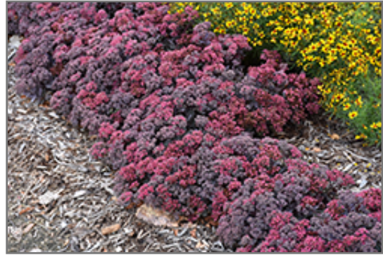
Dazzleberry Stonecrop in bloom