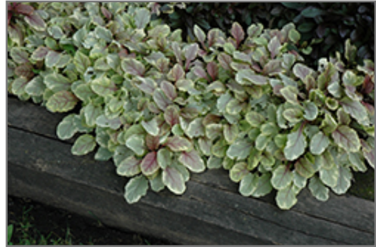
Golden Glow Bugleweed

Golden Glow Bugleweed is recommended for the following landscape applications;