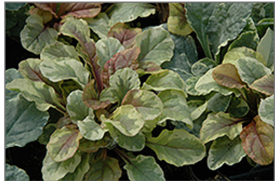
Golden Glow Bugleweed foliage