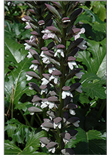
Summer Beauty Bear's Breeches flowers