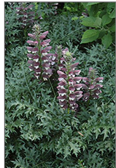
Summer Beauty Bear's Breeches in bloom