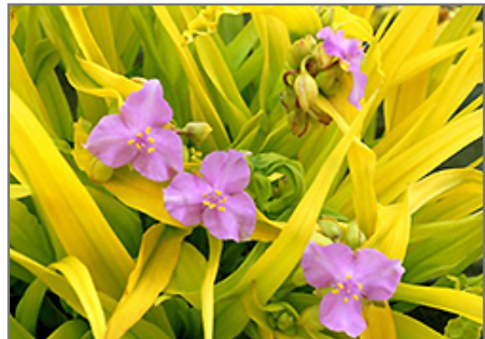
Sunshine Charm Spiderwort flowers