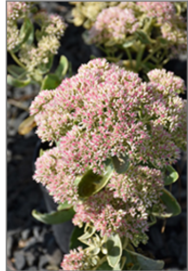
Autumn Charm Stonecrop flowers

Autumn Charm Stonecrop is a dense herbaceous perennial with an upright spreading habit of growth. Its relatively coarse texture can be used to stand it apart from other garden plants with finer foliage.