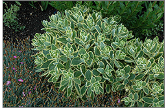
Autumn Charm Stonecrop