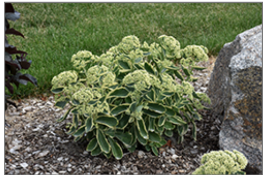
Autumn Charm Stonecrop in bloom