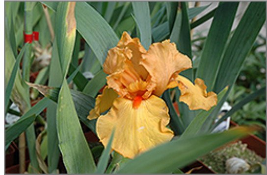
Rave On Iris flowers