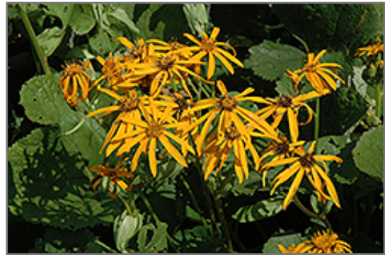
Othello Rayflower flowers