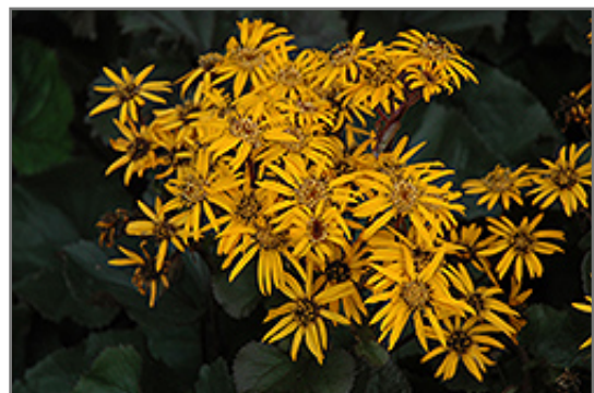
Britt Marie Crawford Rayflower flowers