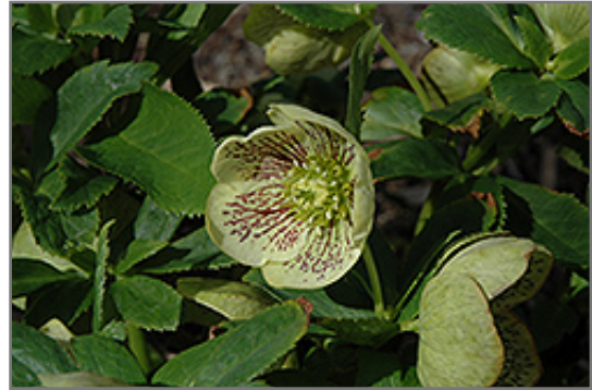
Ice Follies Hellebore flowers