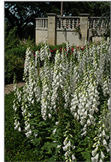
White Foxglove flowers