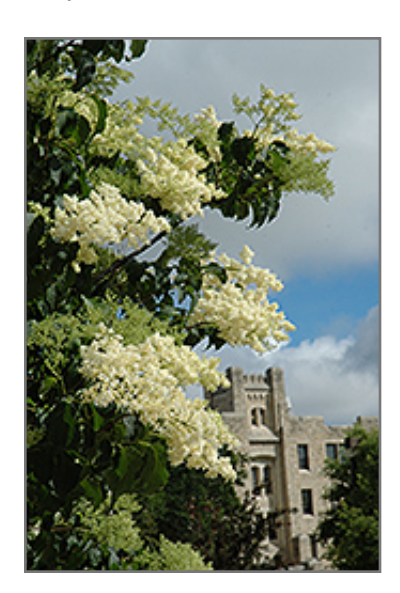
Ivory Silk Japanese Tree Lilac flowers

4681 Lloydtown/Aurora Road King, Ontario L7B 0E3