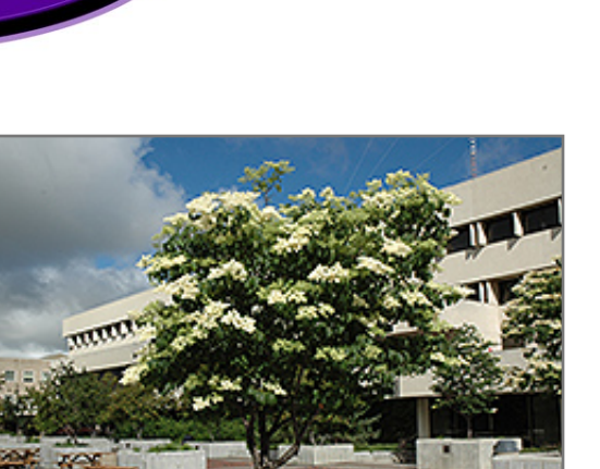
Ivory Silk Japanese Tree Lilac in bloom