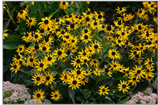
Little Goldstar Coneflower in bloom

This is a relatively low maintenance plant, and should be cut back in late fall in preparation for winter. It is a good choice for attracting butterflies to your yard, but is not particularly attractive to deer who tend to leave it alone in favor of tastier treats. It has no significant negative characteristics.