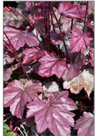
Stainless Steel Coral Bells foliage