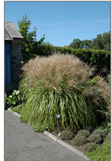
Huron Sunrise Maiden Grass

Huron Sunrise Maiden Grass is recommended for the following landscape applications;