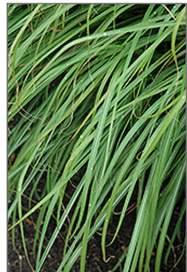
Huron Sunrise Maiden Grass foliage