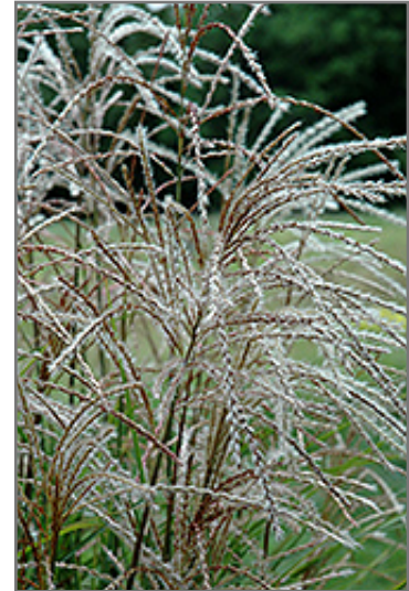
Huron Sunrise Maiden Grass flowers

This plant does best in full sun to partial shade. It prefers to grow in average to moist conditions, and shouldn't be allowed to dry out. It is not particular as to soil type or pH. It is highly tolerant of urban pollution and will even thrive in inner city environments. This is a selected variety of a species not originally from North America. It can be propagated by division; however, as a cultivated variety, be aware that it may be subject to certain restrictions or prohibitions on propagation.